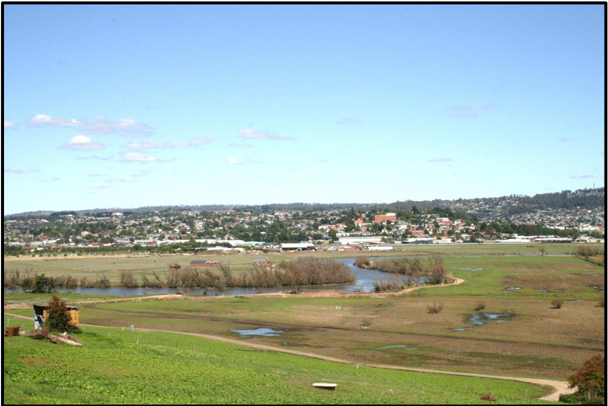
Part of the North Esk delta from Ravenswood

down sediments and, eventually, productive soils that had, for thousands of years been the maternal resource of an ancient people.