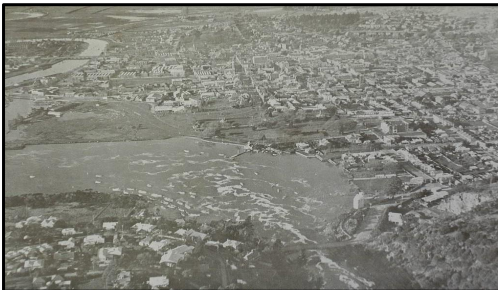
The North Esk confluence with the Tamar shows Royal Park, unformed, and still part of the flood plain long after Launceston was a thriving settlement.

In this region, where three First People Clans intersected, the forces of nature sculpted the land, organic elements created the living diversity, the First People evolved a relationship with the environment and the First Europeans exploited their happenstance.